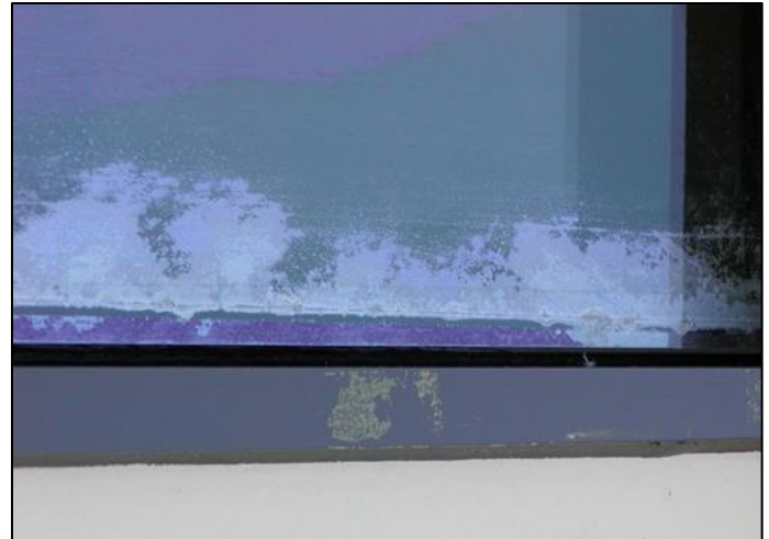
Fig. 03: Coating corrosion due to no edge deletion

The same tests conducted for 1 year on Low-E coatings that had undergone edge deletion showed no degradation of the coating, with the seal of the IG unit intact. Obviously, the IG or window manufacturer cannot control the exposure of the glass edge to moisture or acidic conditions (e.g., acid rain or household cleaning solutions). Therefore, it is difficult to design a system that will not expose the edge seal of an IG unit to these conditions.