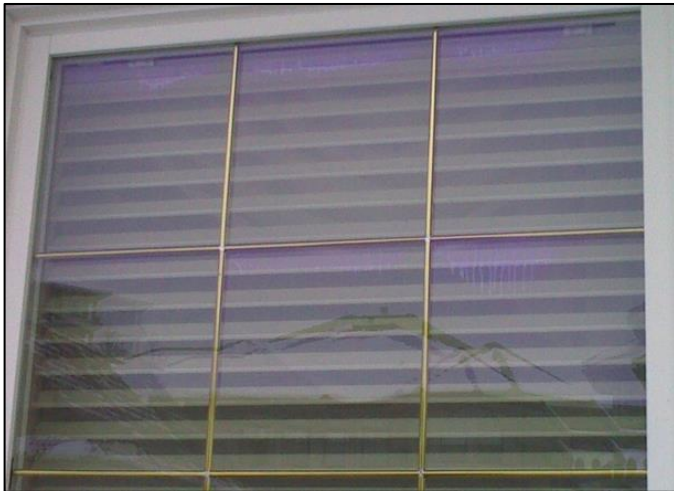
Fig. 10-1: Chemical fogging as seen in a non-Cardinal IG produced unit. Chemical can be seen running down glass in area of internal grilles

Chemical fogging can look similar to condensation in the airspaces. Typically, it is more apparent in IG units with LoE™ coatings and will not dissipate. It is often caused by a temperature differential being applied over the unit. This can be caused by shadow patterns like those from building overhangs (Fig. 10-1).