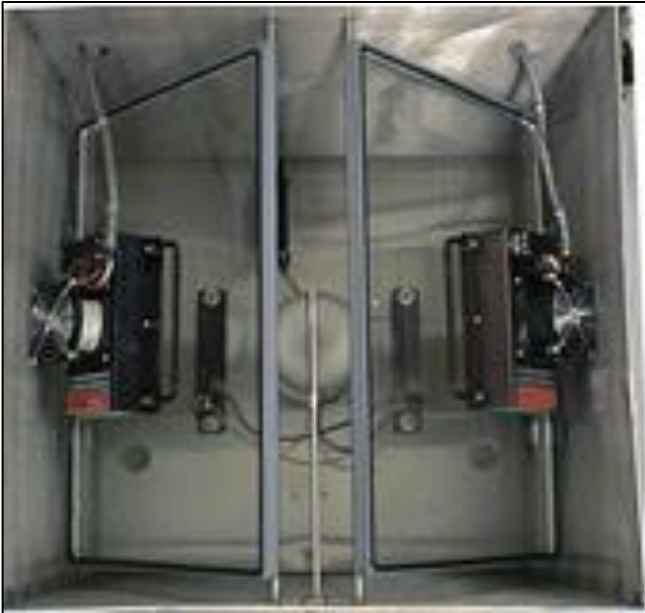
Fig. 10-2: View inside a Cardinal Fog Box

The rating system for fog in the Cardinal Fog Box Test is as follows: